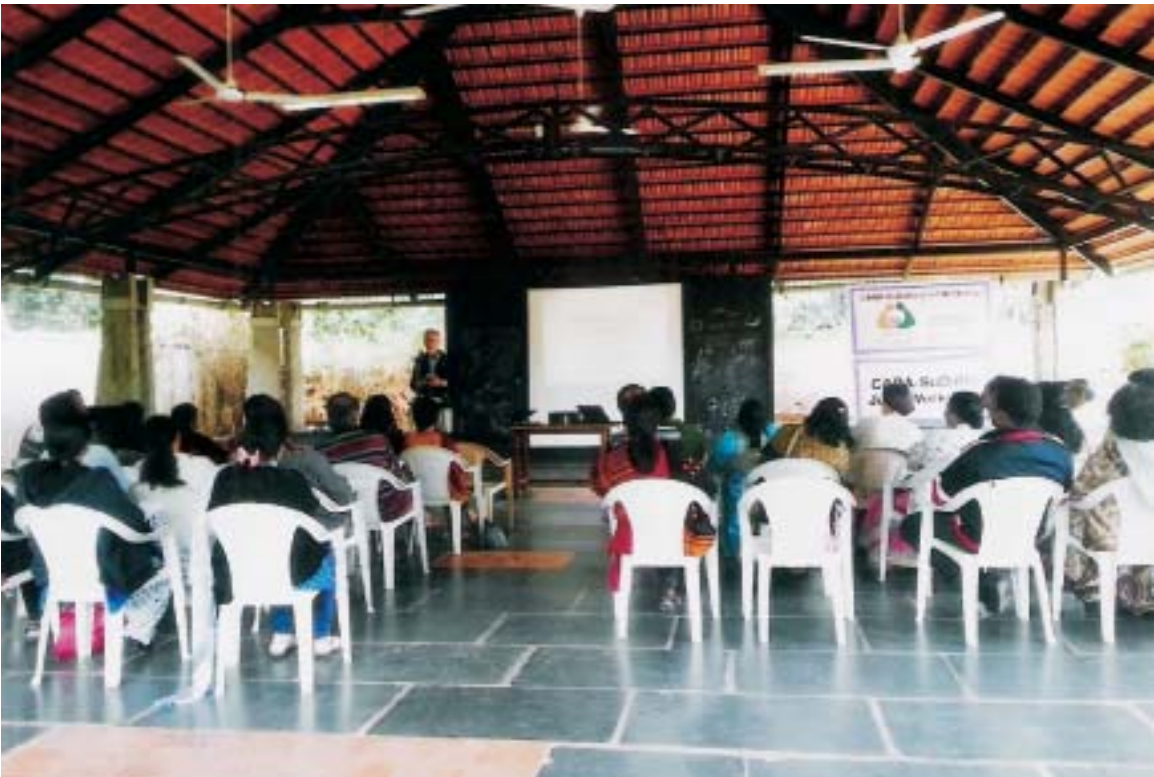
Adoptive Parents/Prospective Adoptive Parents and children during an Interactive Meeting held at Bangalore on 16th & 17th November, 2013