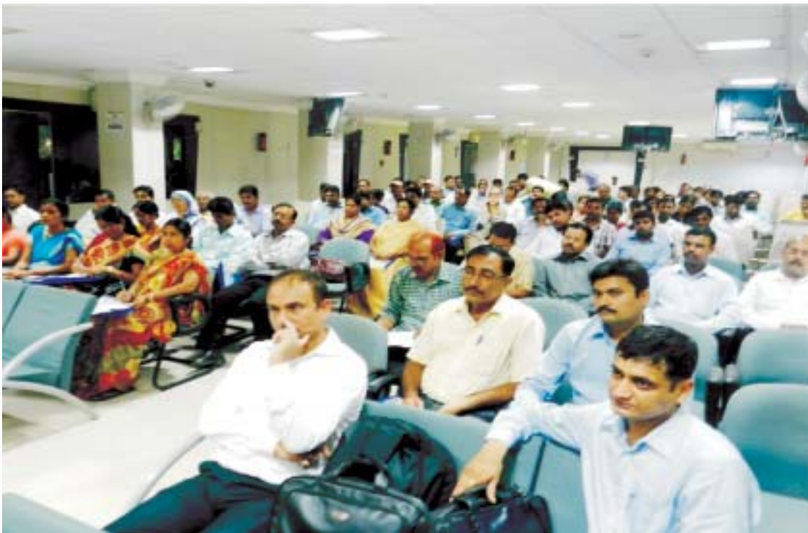
State Orientation Programme at Patna, Bihar on 6th September, 2013