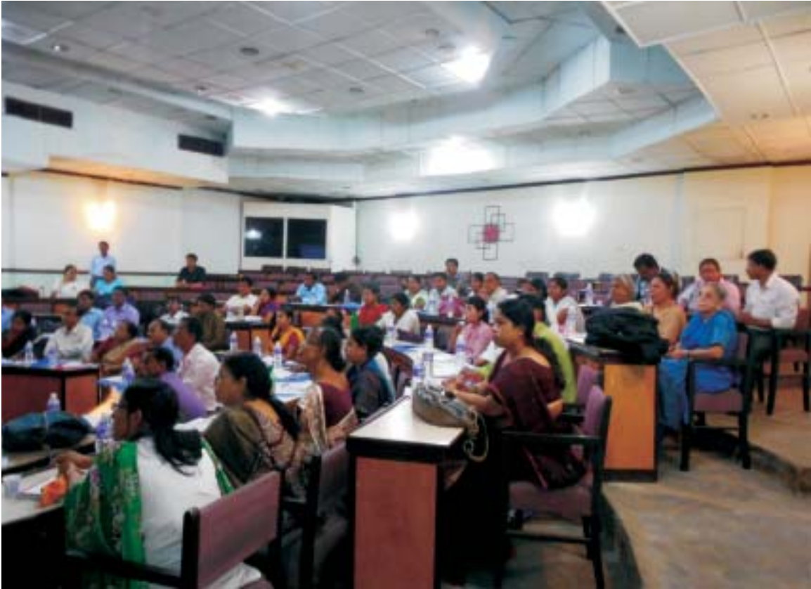
State orientation programme in Kolkata held on 28.3.2014