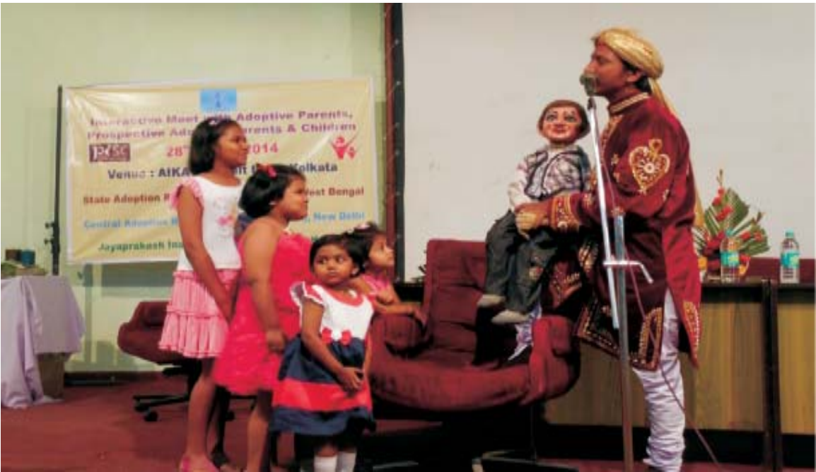
Cultural programme in Kolkata during Interactive Meet with Adoptive Parents, Proposed Adoptive Parents (PAPs) and adoptees