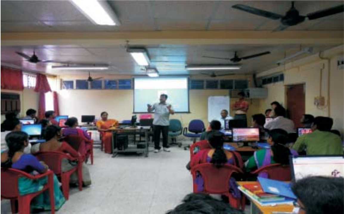
Hands on session on CARINGS, Kolkatta