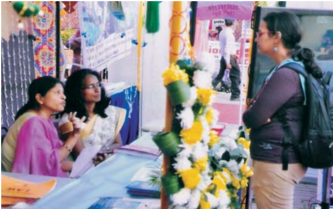
Addressing adoption queries of visitors at Pitampura Dilli Haat during Vatsalya Mela from 17th -29th November, 2013