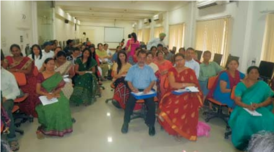
Participants from State Adoption Resource Agency (SARA) during a National Level Programme on SARA Module held on 5th August, 2013 at ISTM, New Delhi