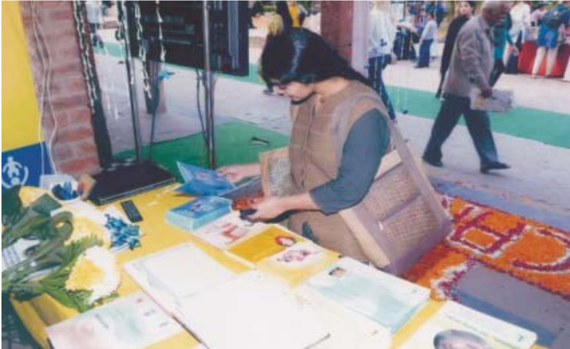
Visitors at INA Dilli Haat during Vatsalya Mela from 17th -29th November, 2013

CARA has also participated in Meri Dilli Utsav held at Pragati Maidan in July & October 2013.